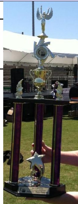
Trophy for Best Decorated Campsite