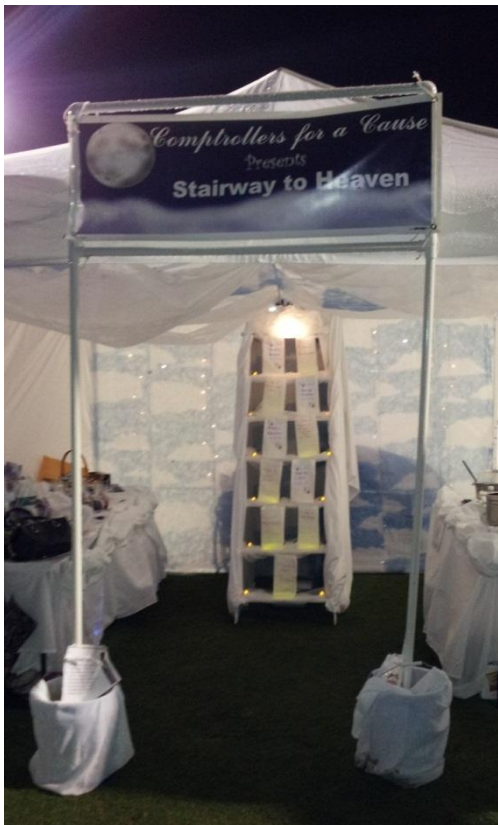
At left: "Comptrollers for a Cause" campsite at 2013 Relay for Life.